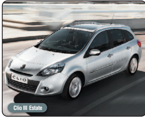
Clio III Estate